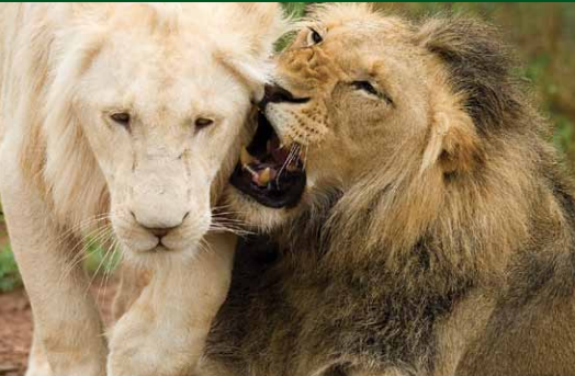
BIG 5 SAFARI

THE ULTIMATE AFRICAN GOLF AND SAFARI EXPERIENCE