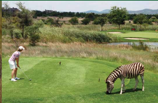
PLAY AMONG THE ANIMALS